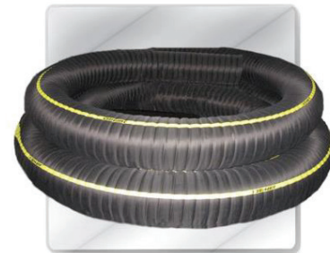
8" Vacuum Truck Hose

Typical specifications that can change according to your requirements: