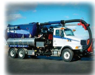
Vacuum hose in service